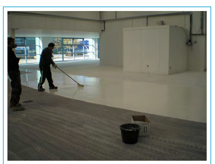
Epoxy undercoat and vinyl flakes are applied to the Stonclad 4mm mortar to enhance aesthetics, protection and slip resistance.

Completed Stontec floor. A highly decorative, durable system providing enhanced aesthetics with excellent cleanablilty and wear resistance.